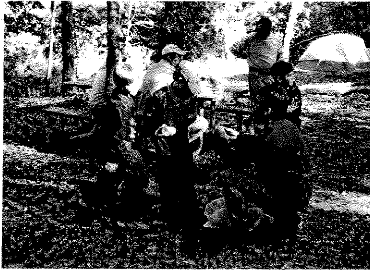
Photo - Fall Campout at Klondyke Park